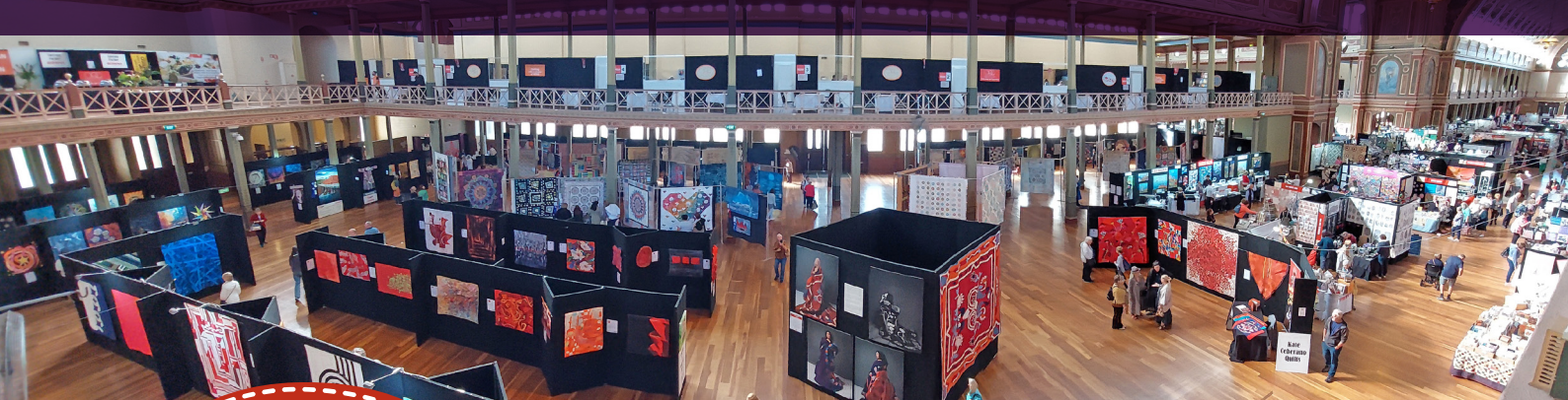
Exhibit at the Australasian Quilt Convention 2025!